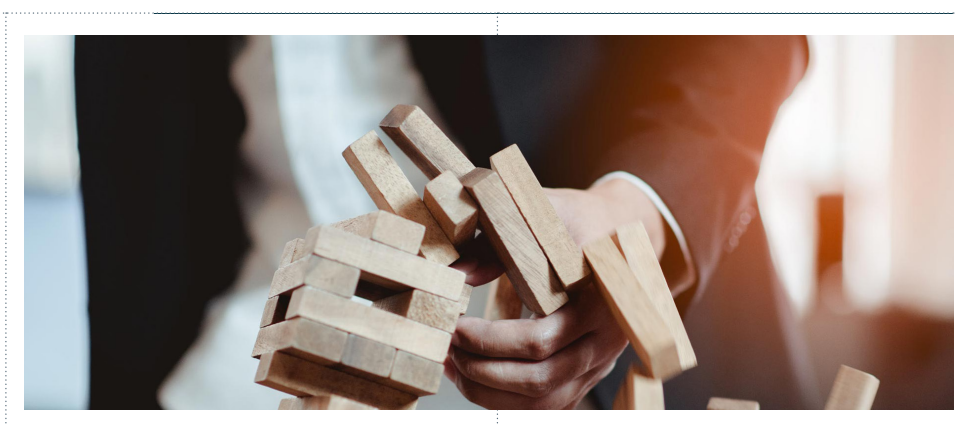
to recognize, assess, and respond to risks proactively.

At the heart of transforming challenges into opportunities is the cultivation of a risk-aware culture within the organisation. This culture encourages not just the identification and mitigation of risks but also actively seeks out potential growth opportunities within these risks. It involves training employees at all levels